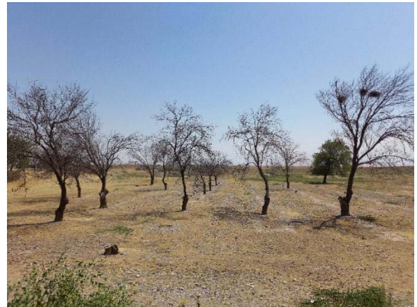
Photos: Drilling wells and dying gardens in the Zafarabad district of the Sughd Province

In this regard, the European Union project " Central Asia Nexus Dialogue Project: Fostering Water, Energy And Food Security Nexus And Multi-sector Investment (Phase II) " and the project "Laboratory of Innovative Solutions for the Water Sector of Central Asia" implemented within the framework of the Central Asia Water and Energy Program (CAWEP) , have joined forces to support the authorized bodies of Tajikistan in search for innovative solutions for the efficient operation of pumping stations.