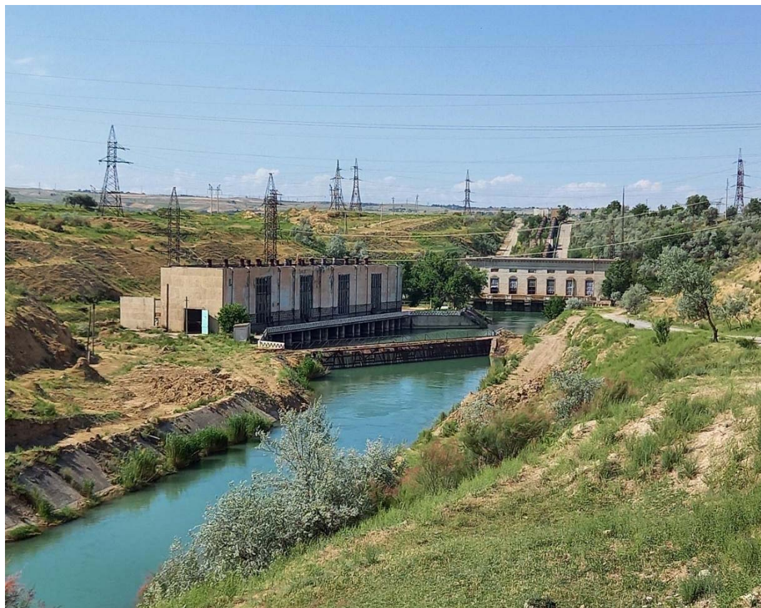
Photo: Golodnostep Pumping Station - 1 in Zafarabad district of Sughd Province

Over 90% of land in Tajikistan is occupied by mountains hovering up to 7,000 meters and higher. At the same time, half of the country is located at an altitude of over 3,000 meters above sea level, and such a mountainous landscape creates the need to lift the water from rivers and canals to irrigate the land. In this regard, over 50% of the irrigated lands of Tajikistan are located in pumping irrigation zones, for which large pumping stations have been built in the country.