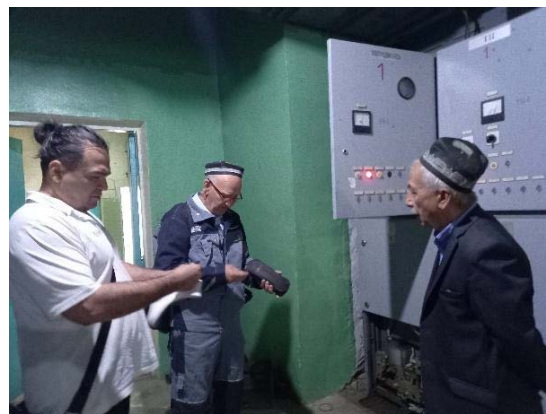
Photo: Measurements of water and electricity consumption in the pumping station Golodnaya Stepskaya Pumping Station - 1 with the support of Grundfos

Author: Aksulu Kushanova, Energy Investment Specialist, CAREC