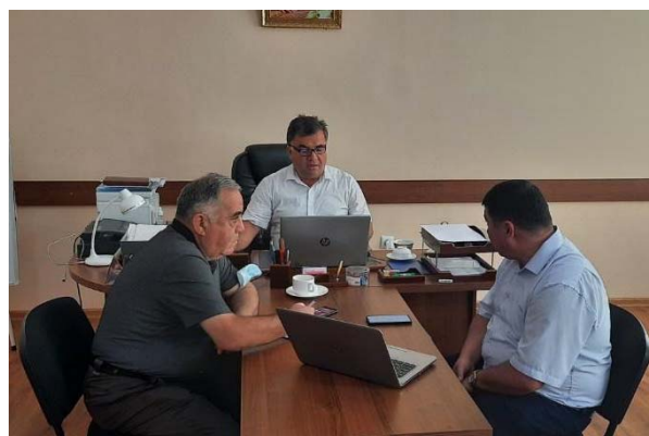
Photo: National experts examine 173 electricity meters in the Sughd Province of Tajikistan

The project also involves the international pump manufacturer Grundfos, which shares international experience in improving energy efficiency with national experts.