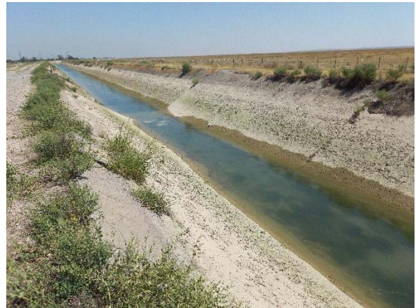
Photos: TM-2 Canal in the Zafarabad district, the beginning of the canal on the left and a shortage of water in the middle of the right.

Due to the lack of water that is delivered through the TM-1, TM-2 and TM-4 canals, farmers are forced to drill wells to irrigate their lands. Well drilling costs range from $ 20,000 to $ 25,000. However, drilling is carried out without preliminary geological surveys. As a result, certain farmers are left without water after drilling the wells and incurring costs because they still cannot access the artery of the aquifer. But some farmers are still making progress in these activities, leading to uncontrolled groundwater withdrawals and lowering aquifer levels, contributing to land degradation in the Zafarabad district, as well as drying up orchards and other crops.