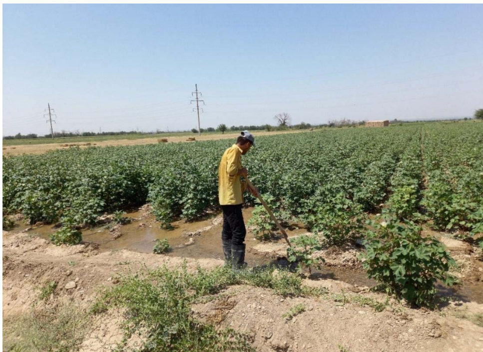
Photo: Local farmers irrigate fields in Zafarabad district of Sughd Province

Meanwhile, pumping stations built in the 1950-1970 have noticeable wear and tear. There are no energy saving equipment at the facilities, and electric meters for measuring electricity consumption in large pumping stations are not automated, which makes it difficult to calculate the actual power consumption.