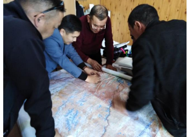
Photo during the work with specialists from the Issyk-Kul office of the Department of Biodiversity Conservation and Protected Areas (Issyk-Kul oblast, Karakol).

Lake San-Tash is located in the northeastern part of Kyrgyzstan, in Tyup district of Issyk-Kul region, at an altitude of 1988 m, coordinates 42°45'09" N 79°00'25" E.