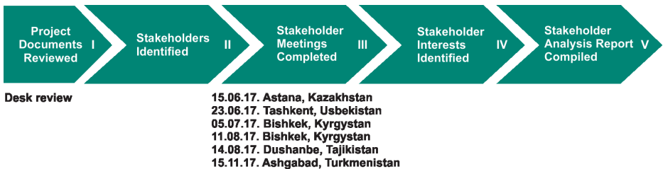
Figure 1. Stakeholder Assessment steps

Step I. To begin the stakeholder analysis, a sound understanding of the activities linked with the Nexus Dialogues Project was undertaken. This was done by reviewing project document, updated log frame and meeting reports;