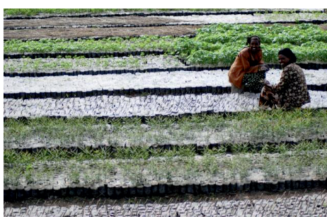
L. to r.: Wells powered by wind in Tunisia; Women planting seedlings at a tree nursery in Ethiopia