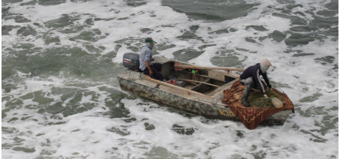
The expedition “From Glaciers to the Aral Sea” started