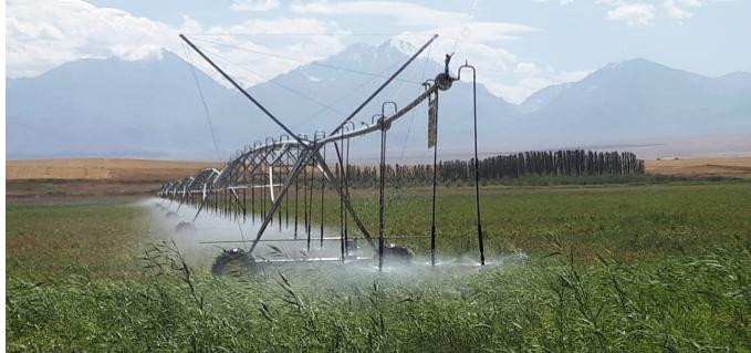
The first public hearings on the law “On Melioration and Irrigation” were held in Tajikistan