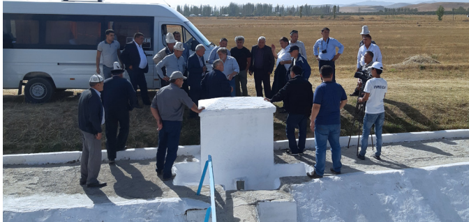
First joint meeting of the Small Basin Councils of Kyrgyzstan and Uzbekistan parts of the Padshaata River